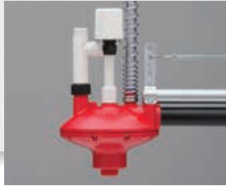
Solenoid Regulator For automatic and unattended system flushing – requires connection to a controller or timer with a 24 VAC output.