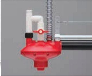
Regulator Delivers high water volume at the low pressure required for no-spill drinking. Built-in flush valve makes for easy removal of sediment, biofilm and air.