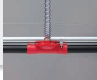
Slope Neutralizer Reduces slope pressure by a preset amount, requires no adjustment and maintains system pressure setting even when birds are not drinking. Required in sloped houses only.