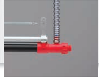
End Assembly Opens automatically during the flush mode for easy and effective flushing.