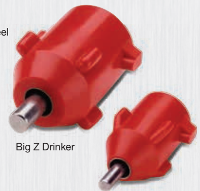
Big Z Drinker

Big Z Shielded Drinker Helps Prevent Spillage The shield forces broiler breeder/parent birds to drink at the proper angle. Useful in sloping slats applications. Not suitable for day-olds, ducks and geese.